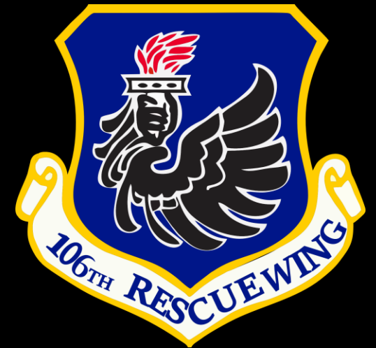
Francis S. Gabreski Air National Guard, NY