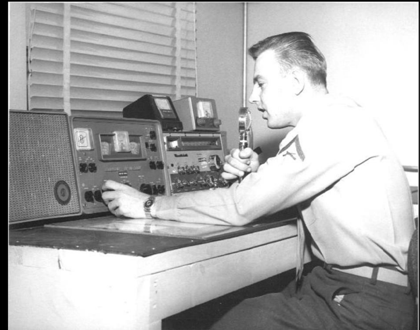
W6IAB – Camp Pendleton, CA