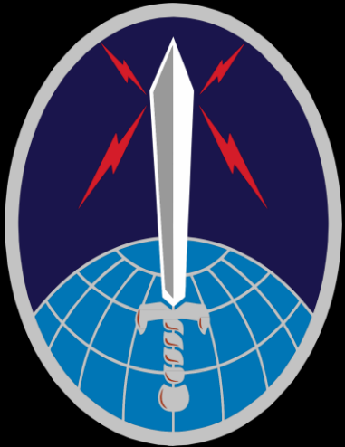
Schriever Space Force Base, CO