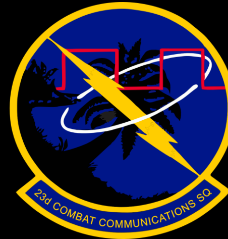
Travis Air Force Base, CA